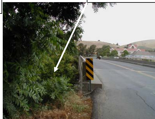
I-780 over crossing prior to improvements